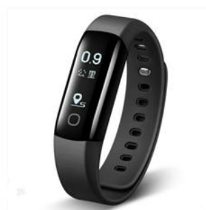
LCD for smartable device