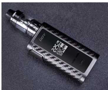
LCD for E-cigs